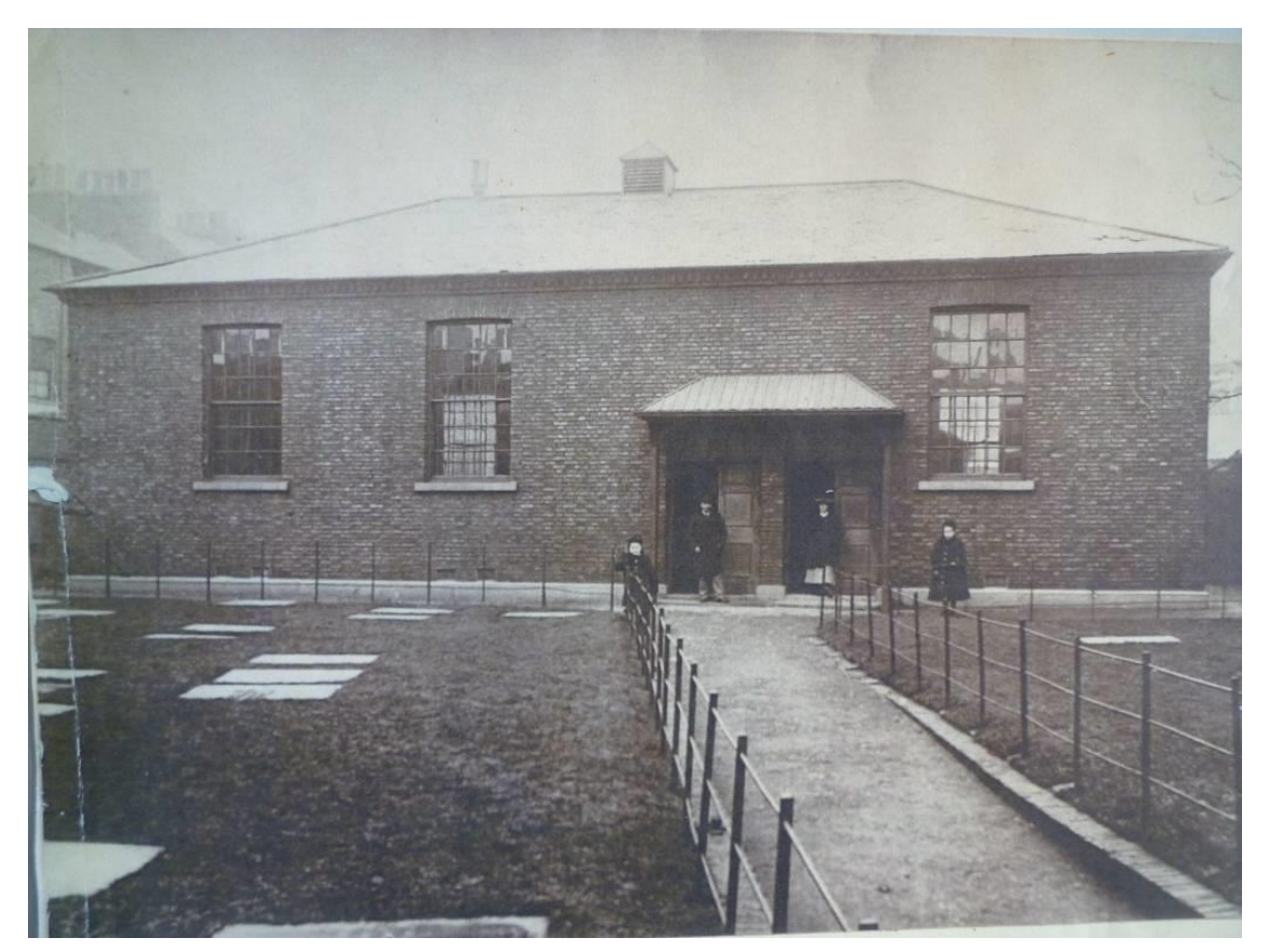
Fig. 1 The old meeting house of 1801 in St Sepulchre Street, which survives as a private house.

Friends gathered in the house of Peter Hodgson in Carr Street from the 1650s and in 1676 a chapel was built in Low Conduit Street (now Sandgate). Friends were numerous in Scarborough and for much of the eighteenth century the meeting house was a fashionable and convenient place for visitors to worship. In about 1800 the building was lost to town improvement and a substantial new meeting house with two main rooms was built in 1801 off St Sepulchre Street (fig.1), on a site formerly occupied by a Franciscan convent. The meeting house building still survives (fig.4). In 1894 Friends followed the move of the town centre away from the harbour area and bought a site in York Place where a new building in a simplified Tudor style (fig.2) with a large main meeting room and other facilities was erected to the designs of Fred Rowntree. This building was demolished in 1988 as part of a redevelopment scheme and Friends obtained a new site at Woodlands Drive on the western outskirts of the town near Scarborough Hospital. A new meeting house with a detached residence for a warden was built to the designs of Edwin Trotter, with a Joseph Rowntree Trust development of sheltered housing nearby. The cost of the new site and new meeting house was met almost entirely from the compensation paid for the loss of the York Place site. The new meeting house opened in 1990