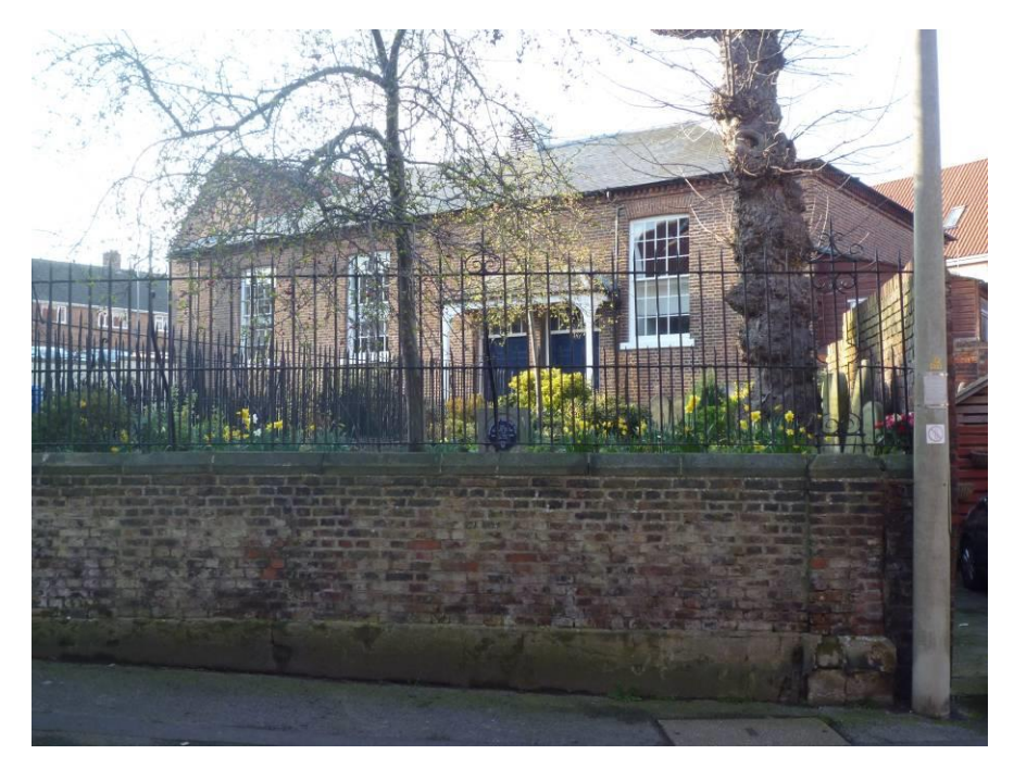
Fig.4 the former meeting house and burial ground in St Sepulchre Street

The former meeting house in St Sepulchre Street, in central Scarborough, (TA 046 888) survives in use as a private dwelling. The burial ground is a private garden, but retains several burial markers.