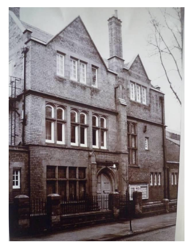
Fig.2 The 1894 meeting house in York Place by Fred Rowntree, demolished in 1988 (Scarborough Local Meeting archive)